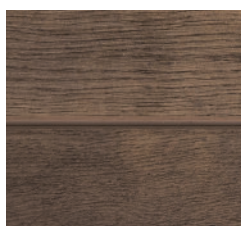
Antique Oak: MCL360A