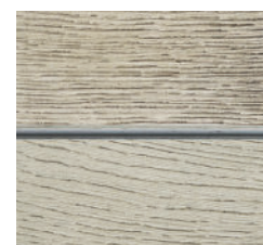
Smoked Oak: MCL360D