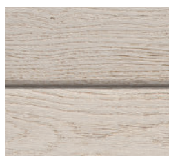
Limed Oak: MCL360L

When fitted in accordance to our install guides