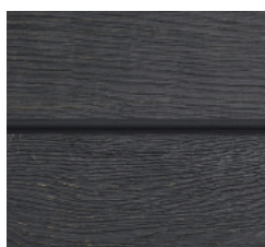
Burnt Cedar: MCL360R