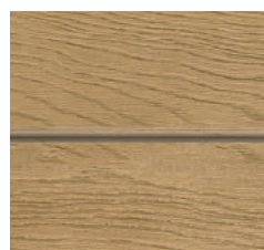
Golden Oak: MCL360G